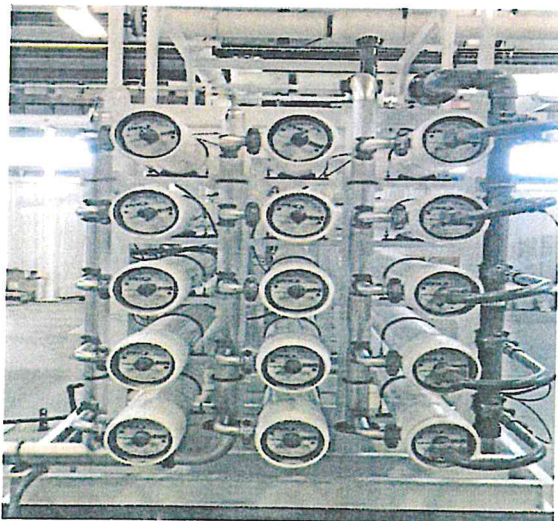
MEMBRANE SKID (End View)