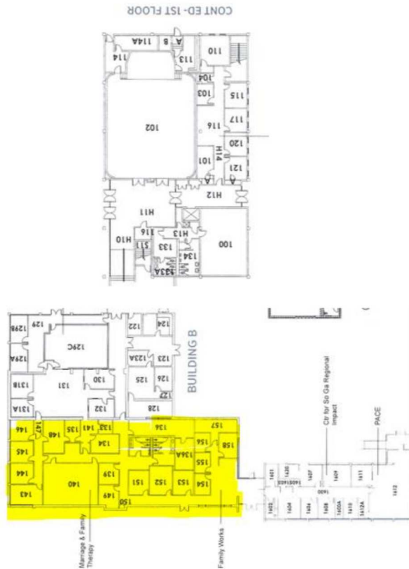
(Premises highlighted in Yellow Above)